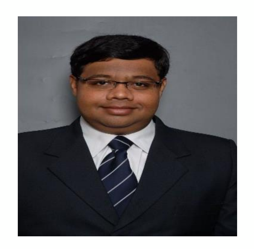
Practice Leader (Partner) BE-Mechanical, MBA Finance